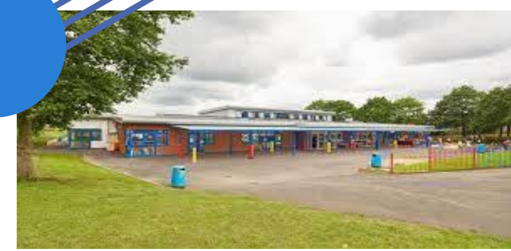
Newsletter – September 22<sup>nd</sup> 2023