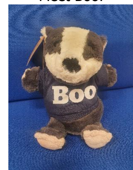
And finally... Meet Boo!

He is our school mascot, named after the badger who visits our school grounds at night time. We have our very own cuddly version who will spend time in the classes in school over the year for all things attendance.