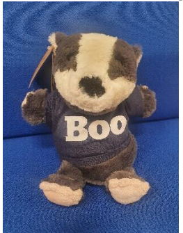
Year 2 and Year 6!

We've had a fabulous start to the school year, with everyone on top form, on time, focused and ready to learn. Therefore, deciding who Boo stays with for the week has been a tricky decision. However, for setting a fabulous attitude and showing responsibility to others, the oldest pupils in each key stage are the lucky recipients. Boo will visit more classes next week!